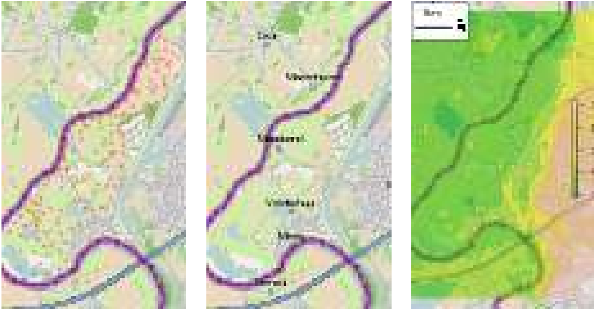
(a) data locations