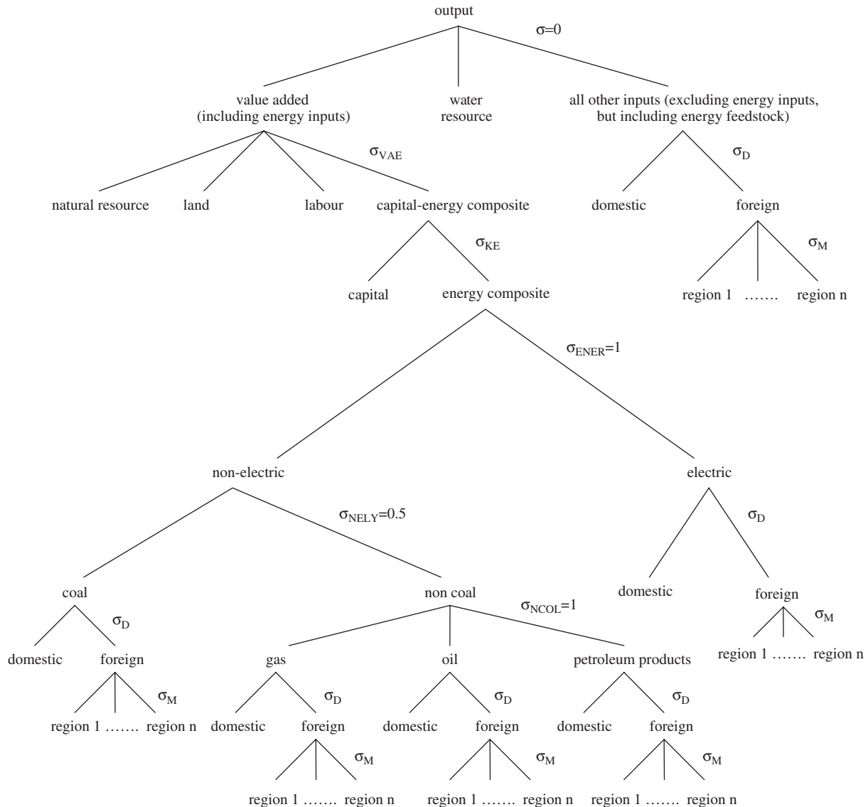
Fig. A1 – Nested tree structure for industrial production process.

Aggregations in GTAP-W are shown in Table A1. Regional characteristics are shown in Table A2. Substitution elasticities